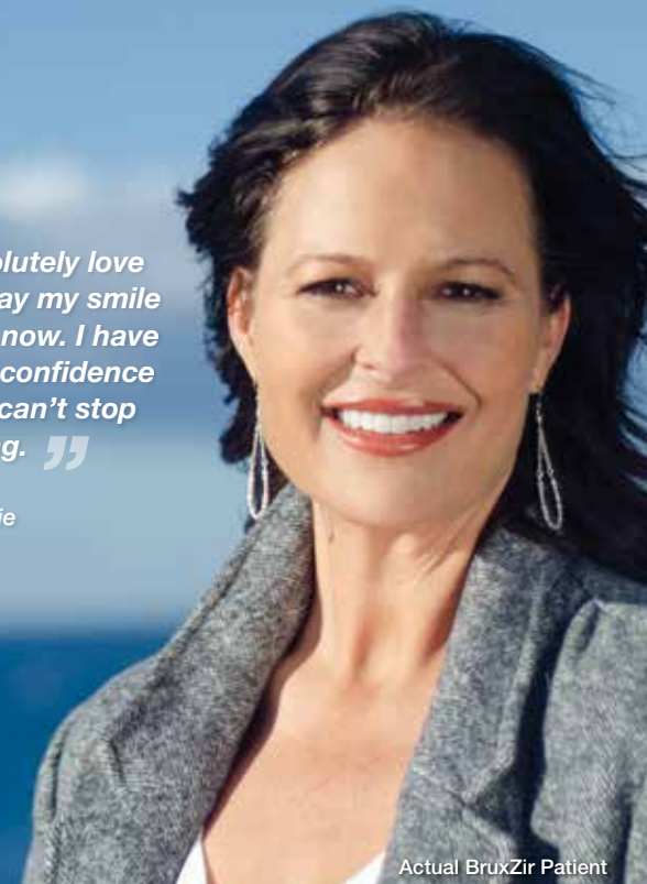
Actual BruxZir Patient