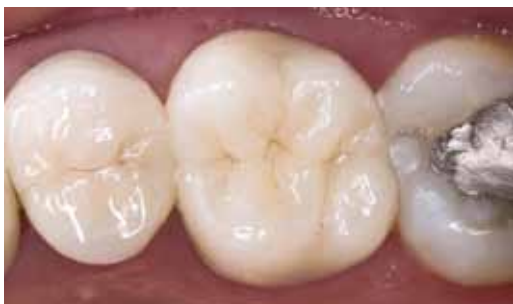
A Prismatic Clinical Zirconia crown was prescribed and the final results look beautifully natural.